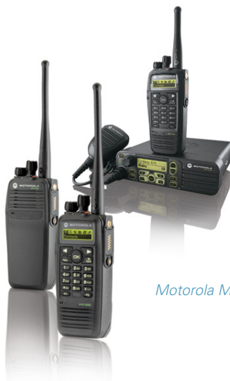
Motorola MOTOTRBO XPR Digital Radios